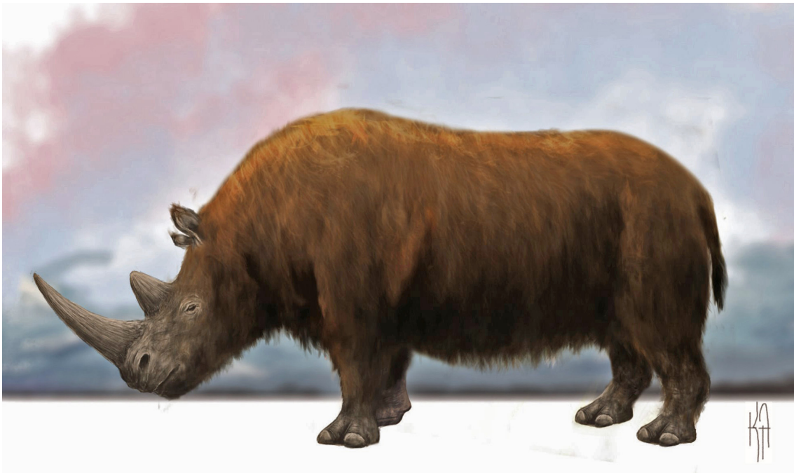
Fig. 1. Drawing of a woolly rhinoceros (WOOLRHINOPOLI Project).

Genetic investigation has shown that the extinct woolly rhinoceros is most closely related to the extant Sumatran rhinoceros (Orlando et al., 2003). Phylogenetic inference, based on a complete mitochondrial genome sequence of fossil Stephanorhinus from the Chondon River valley (Arctic Yakutia, Russia), has confirmed that of the extinct species, woolly rhinoceros, Coelodonta is most closely related to Stephanorhinus (Kirillova et al., 2017). A study of ancient DNA from eastern European sites further suggests that the effective population size of woolly rhinoceros increased at 29.7 ka BP and then remained stable until near extinction, ca 14 ka BP (Lord et al., 2020). The extinction of the Stephanorhinus species has also been studied, leading to the conclusion that Stephanorhinus etruscus went extinct at the Early–Middle Pleistocene (in Italy and the Iberian Peninsula) or the late Early Pleistocene (in Central Europe) (Pandolfi et al., 2017), while Stephanorhinus hundsheimensis became extinct in the late Middle Pleistocene–early Late Pleistocene (in Spain) (García-Fernández et al., 2023), Stephanorhinus hemitoechus at 41 ka BP (in Italy) (Pandolfi et al., 2017), and Stephanorhinus kirchbergensis at about the early Late Pleistocene – that is 120–104 ka BP (in Europe) or 13 ka BP (in China) (Shpansky, 2017).